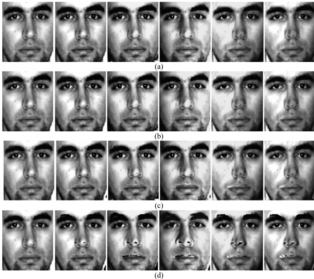
Fig. 2. Image re-rendering results for different bootstrap combinations: (a) 10 persons (b) 5 persons; (c) 3 persons; (d) 1 person

The other two subsets where the illumination conditions are worse also produce high performance but it has to be stated that some noise and feature corruption became visible (Fig 3).