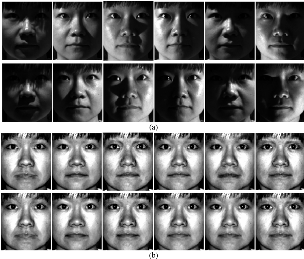
Fig. 3. Illumination restoration for images of Subset4 (up to 70°) (a) Before preprocessing and illumination restoration (b) After illumination restoration

Obviously our proposed approach can significantly improve the recognition rates. Other methods have achieved high recognition rates on the YaleB database, but they require a large number of images for each person. A recent work [Zhan05] proposes an illumination invariant face recognition system from a single input image. It tries to solve the problem by using spherical-harmonics basis-images and they achieve very good results. However they specify that the computational burden of such an algorithm is high for the integration in a real time system.