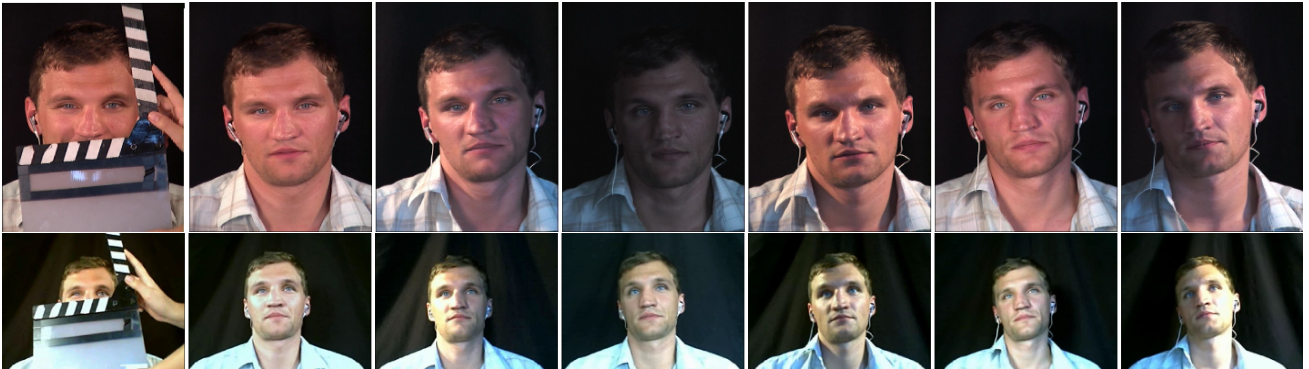
Figure 1: Database recording. First row recorded by VCR camcorder Canon MVX3, the second by webcam Philips SPC 900NC. First snap is with clapper board, the rest snaps are for illumination conditions IC 1-6 look at the table 2

cheaper and the storage of the data is not so problematic as was in the past. The distribution is also easy thanks to the internet connection. The list of some databases is as follows: LPFAV2(Pera et al., 2004),MANDARIN CHINESE (Liangi et al., 2004), AVOZES (Goecke and Millar, 2004), XM2VTS (Messer et al., 1999), IBM ViaVoice (Neti et al., 2000), UWB-05-HSAVC (Císař et al., 2005). There could be many criteria to compare the databases see Table 1 for other comparison.