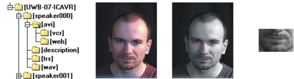
Figure 3: right side: Database structure. Avi folder contains both visual recording (camcorder and webcam), description contain information about region of interest (ROI), trs contain transcription of acoustic part, wav contain acoustic files left side: original frame, eyes and mouth find by ASM, selected ROI

This paper present design and recording of the new czech audio-visual speech database intended for experiments on various impaired conditions. We concentrated on changing the illumination. Result is audio-visual speech database UWB-07-ICAVR which is a valuable resource for testing algorithm for visual speech parameterization under variable illumination.