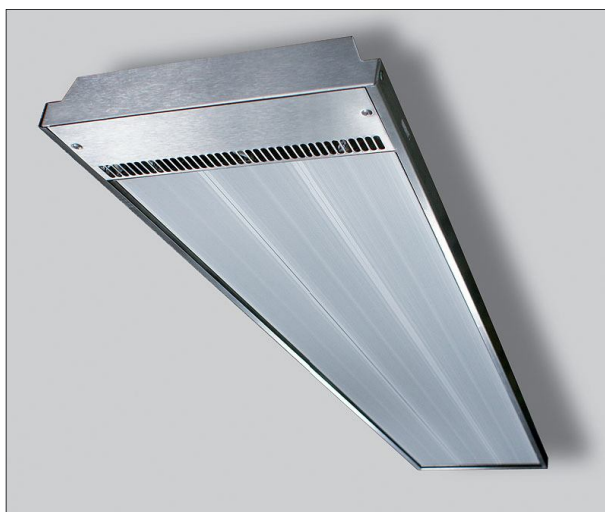
Figure 2 Ceiling-mounted radiant panel