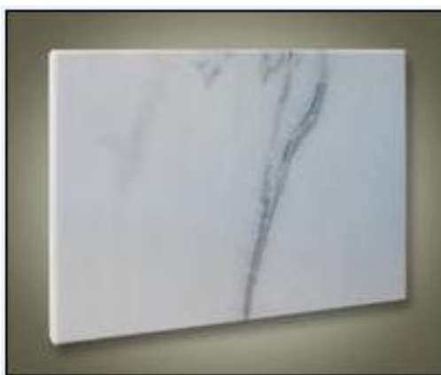
Figure 1 Wall-mounted radiant panel

Radiant heating panels operate on a line-of-sight basis: you'll be most comfortable if you're close to the panel. Some people find the ceiling-mounted systems uncomfortable, since the panels heat the top of their heads and shoulders more effectively than the rest of their body.