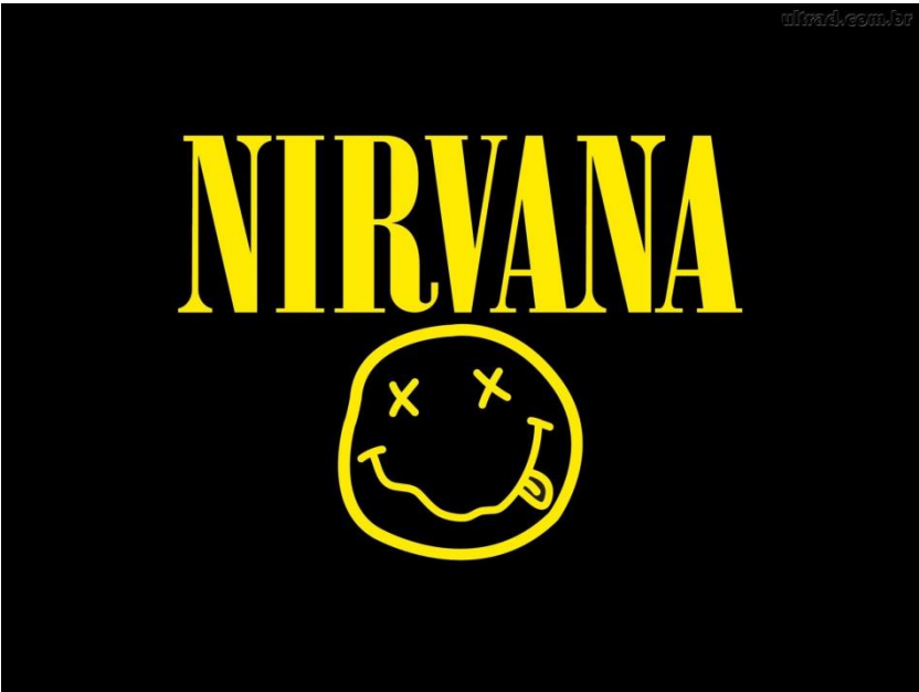
Nirvana's logo [146]