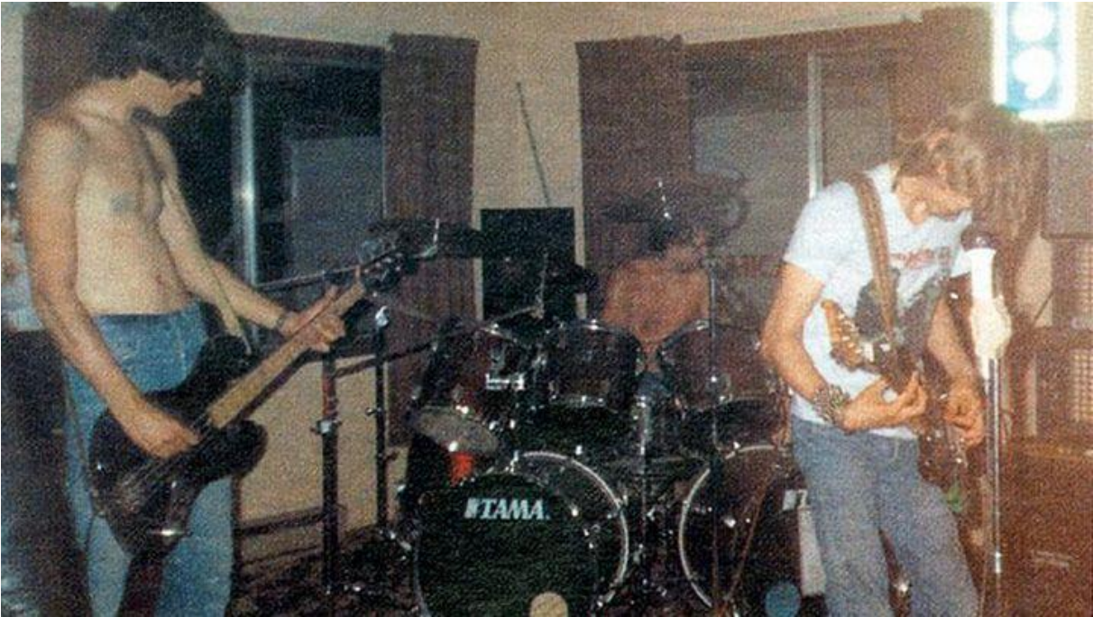
Nirvana's rare photo, 1987 [145]