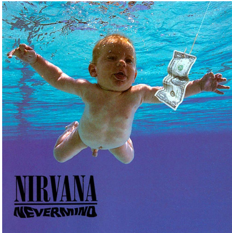
Their most famous album – Nevermind [147]

Underneath the bridge The tarp has sprung a leak And the animals I've trapped Have all become my pets And I'm living off of grass And the drippings from the ceiling It's okay to eat fish 'Cause they don't have any feelings