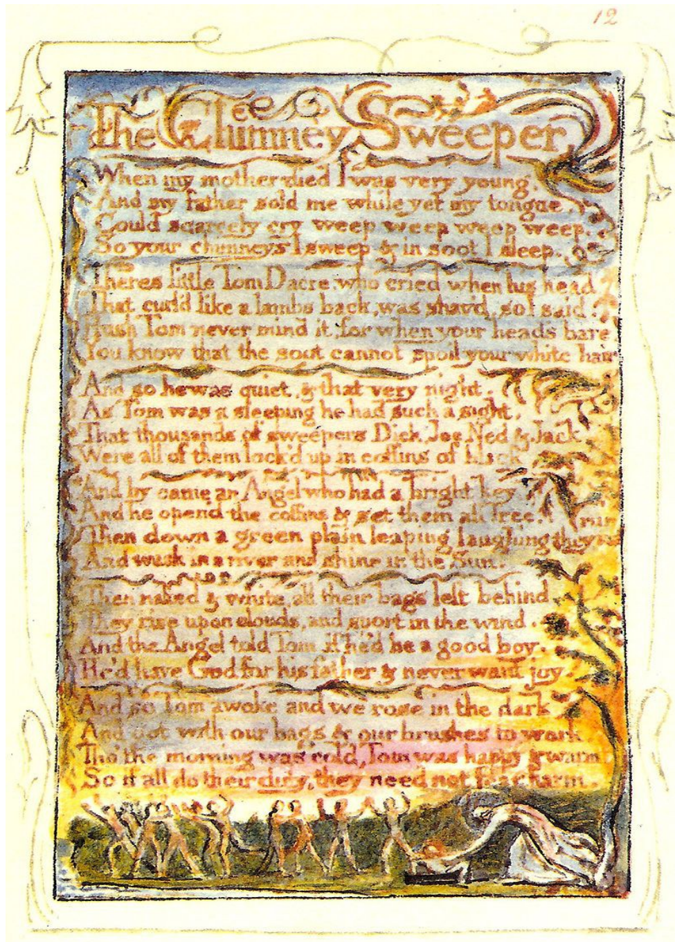
Figure 2: Songs of Innocence – The Chimney Sweeper

Available from https://commons.wikimedia.org/w/index.php?curid=1090489