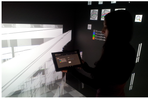
Figure 1: CAVE application with tablet interface.

[Bed09]. Finally, a library for creating general GUIs in tablets for VR environments has also been developed [Har02].