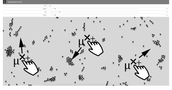
Figure 2. Process of adding centroids to intelligent swarm visualization (DataOcean@ISAC)

Intelligence [Cui00c] combined with k-Means [Bin00a] and Particle Swarm Optimization [Cui00b] will be used to organize the data structures by themselves.