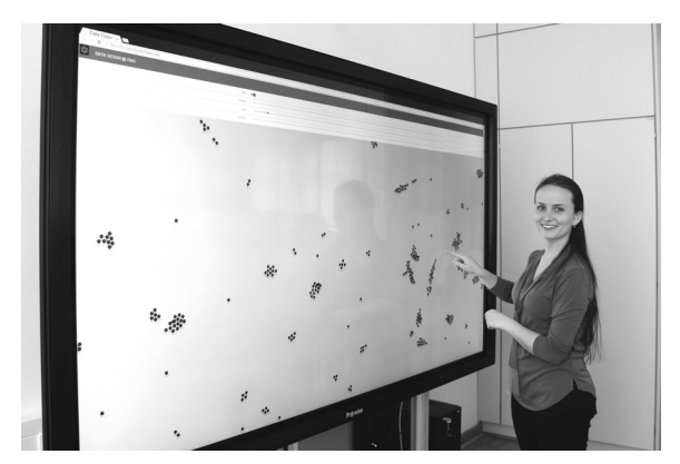
Figure 3. Human Machine Interface: Using DataOcean@ISAC on an 84" touch wall

Furthermore, a performance optimization of the DataOcean@ISAC visualization algorithm will be strived. The actual algorithm is limited to managing several thousand data objects, depending on the used hardware. The number of presentable particles has to be enhanced in order to use the visualization with big data structures. The use of JavaScript visualization runtime is browser based and adaptive to any display size. Therefore, the enhancement of the performance will guarantee proper usage of inefficient devices like tablets or smartphones in comparison to powerful PCs, touch tables or big touch walls. Figure 3 depicts an early version of the DataOcean@ISAC framework used on an 84" touch wall, which can be used in an authentic facility environment and is able to display big amounts of data.