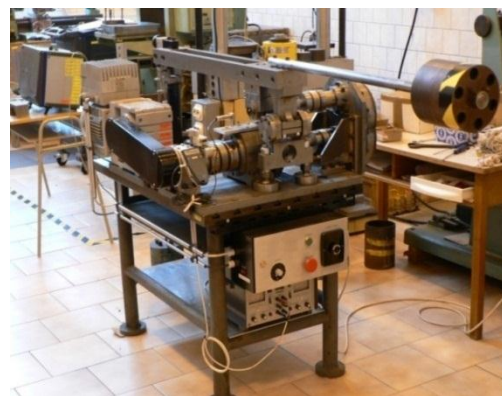
Figure 1 – Measurement of contact path width (left) and TUORS II twin-disc experimental rig (right)