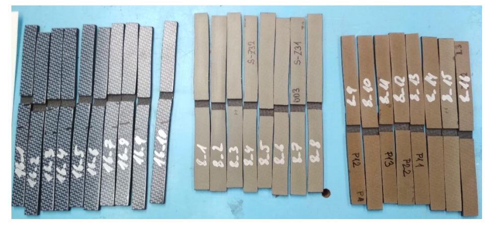
Fig. 3. Tested specimens

Next part of the work is comparison of interlaminar shear strength of our part (which is consolidated from two plates with 8 layers of fabric) with properties of plate manufactured from 16 layers of fabric. One set of specimens cut from 16 layers plate and two sets of specimens cut from profile with 2x8 layers were prepared for tests. Experiment and its evaluation is like single lap joint testing (according to ČSN EN 1465 standard for example). Tests were done on TIRA 2300 machine with loading speed 1 mm/min. Tested specimens can be seen in Fig. 3. Results can be seen in Table 1.