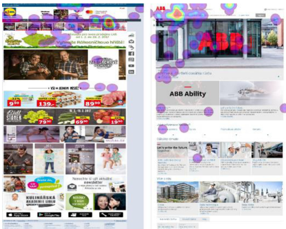
Figure 3. The heat maps of Lidl and ABB websites when locating the link to their career websites.