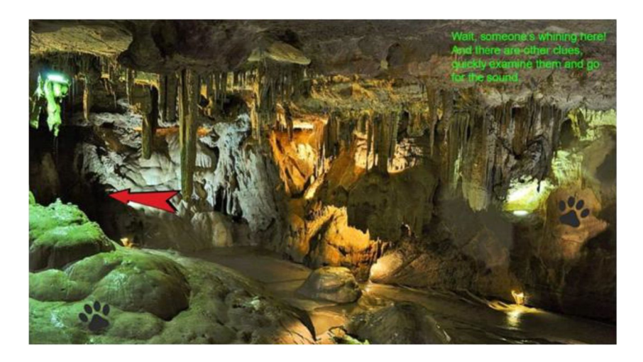
Figure 2: Task room

As for the feedback, not only did the children like the game, the youngest were fascinated by the story itself, the older ones also thought about it and practiced counting. Just some tasks could be shorter.