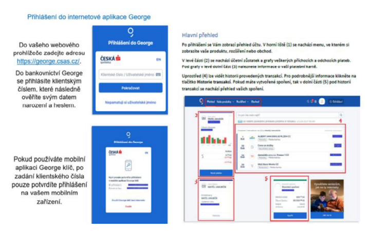
Figure 3. A draft of a newly designed user manual

In the first picture we can see the official manual, which can be found on the website of Česká spořitelna, which is listed here. The manual looks like it has several chapters that individually describe the steps for logging in, for example, or here they describe what the George app can actually do. However, we don't find any detailed description of how to make a payment, for example, where we can see an overview of our transactions. And what we mainly don't find here are pictures that would navigate where things are in the application and that would help in better orientation in the application, which I consider the biggest shortcoming. Seniors who are new or very new to online banking need more help than just the steps described. All of us, not just seniors, find new applications easier to use if we have a preview of what the application looks like and where to find the various tools we want to use.