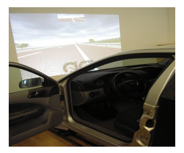
FIGURE 1. Car simulator.

The track is projected on the wall in front of the car simulator.