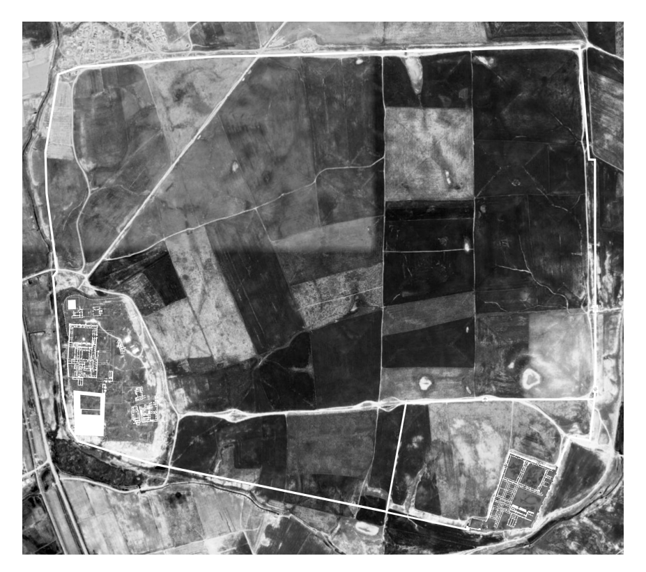
Figure 1. Plan of Kalhu.19

The palace complex occupied the southeastern city corner and was adjacent to a large open area surrounded by the wall. It is probable that stables, granaries, and storages for less rare commodities, for which there was not enough space inside the palace-fortress, adjoined the northern and western sections of the wall.<sup>20</sup> The palace consisted of three large courtyards surrounded by rooms and smaller courts. Some rooms around the northwest courtyard served as workshops for repairing military equipment, including chariots, and the others were storerooms for military implements and supplies. Similarly, the rooms around the northeast courtyard were originally storages and workshops, but several of these spaces later became residences. The place of most importance is the northern corner, from where about