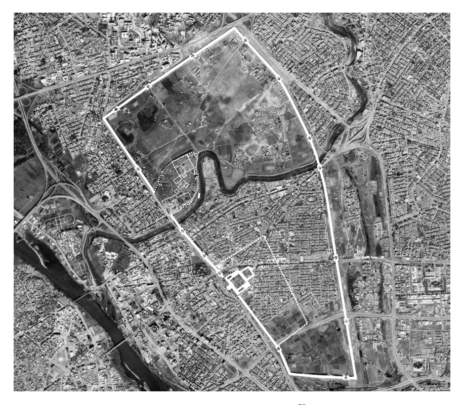
Figure 3. Plan of Nineveh.<sup>52</sup>

necessarily mean four completely separate palace districts. Both Akkadian terms have broader use, so it is better to understand them as administrative "units" or "households," especially in administrative texts.<sup>51</sup> Therefore, the "palaces" could be separate administrative entities of the military district at Nebi Yunus. In some texts, the name of one part – most frequently b\bar{t}t/ekal kutalli or ekal m\bar{a}\bar{s}arti – may refer to the whole complex, which is not unusual in Assyrian texts.