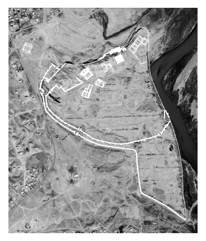
Figure 5. Plan of Aššur. 138

The excavations in Aššur, the oldest Assyrian capital and seat of the two most significant war deities, Aššur and Ištar, did not prove any specialized armory palace. But it is possible that, at least before the move of the administrative center to Kalhu, Aššur had a building or part of it that fulfilled similar functions as later armory palaces<sup>137</sup> since the city was the seat of the ruler and undoubtedly housed a reasonably large number of soldiers requiring the necessary facilities.