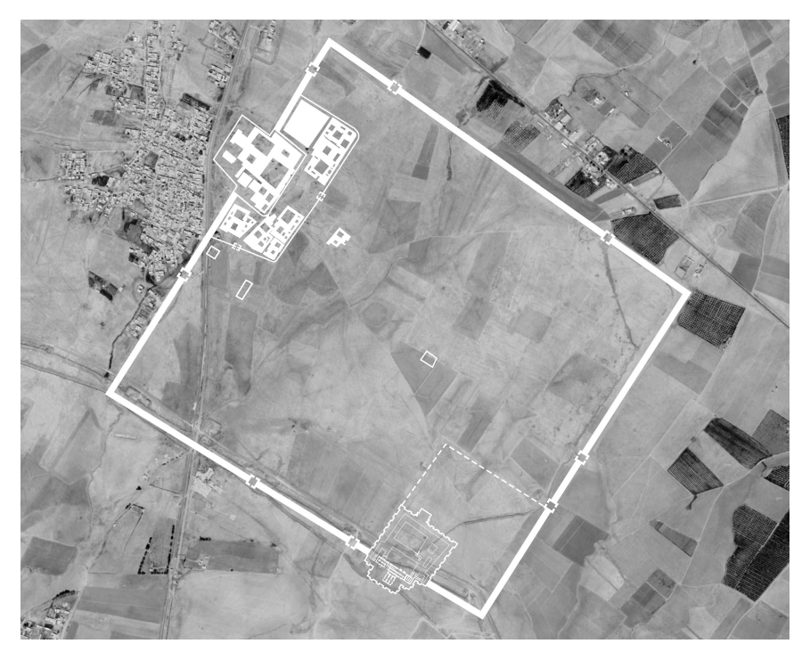
Figure 4. Plan of Dūr-Šarrukīn.<sup>61</sup>

at Nineveh dated to the reign of Sargon<sup>58</sup> show that this ruler used the armories in these cities during his reign.<sup>59</sup> Their significance is also evident because although Sargon II does not mention the start point of his military campaigns very often, it was Kalhu from which his army set out on a military campaign against Urartu in 714 BCE.<sup>60</sup>