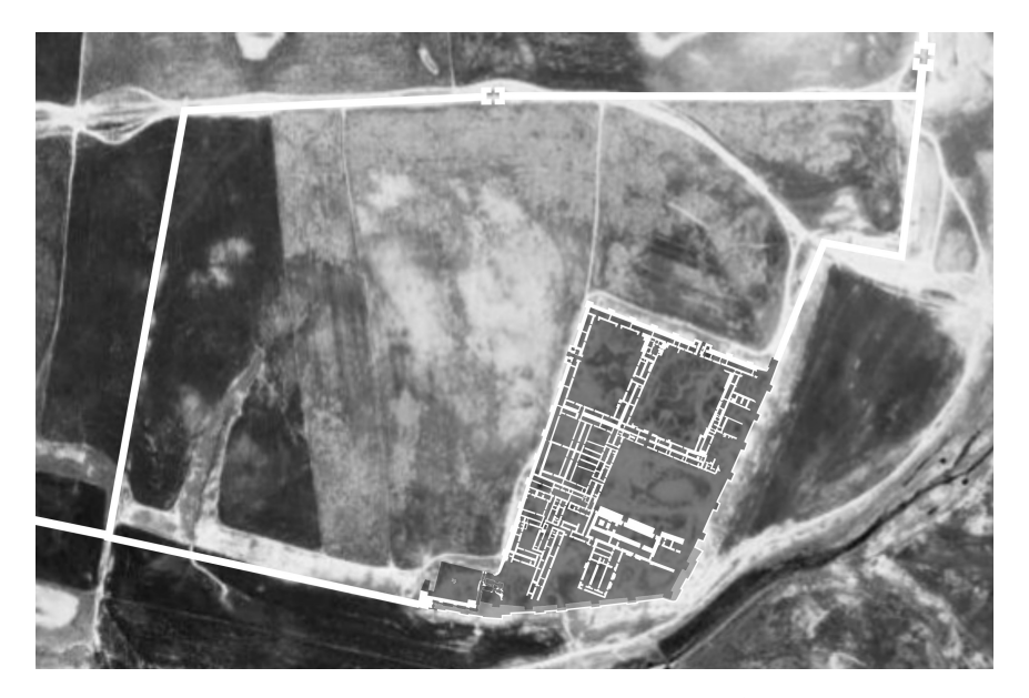
Figure 2. Plan of ekal māšarti of Kalḫu.<sup>24</sup>

80 administrative texts come.<sup>21</sup> This sector probably served as an abode of a high-ranking official.<sup>22</sup> The rooms in the west corner formed another apartment, perhaps that of rab ekalli , the official in charge of the armory palace.<sup>23</sup>