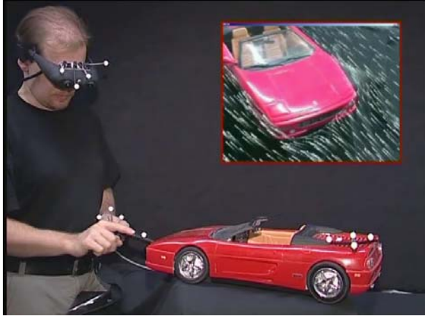
Figure 1: Texture based flow field visualization in AR setup. The users view is displayed in the right top corner.

The animation of the original FROLIC method is either accomplished by a cyclic variation of the streamlet intensity or by color-table animation. Nevertheless additional filter operations have to be applied for suppressing pulsation effects.